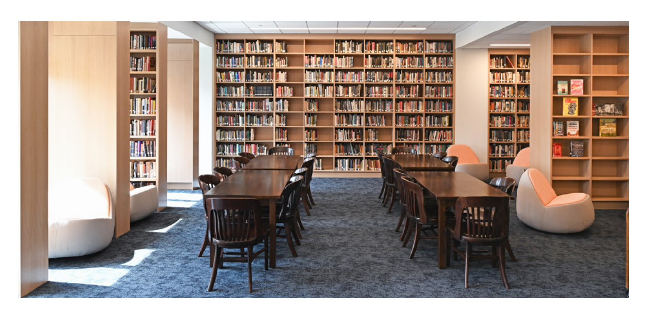
A look inside our new home: 115 East 97th Street